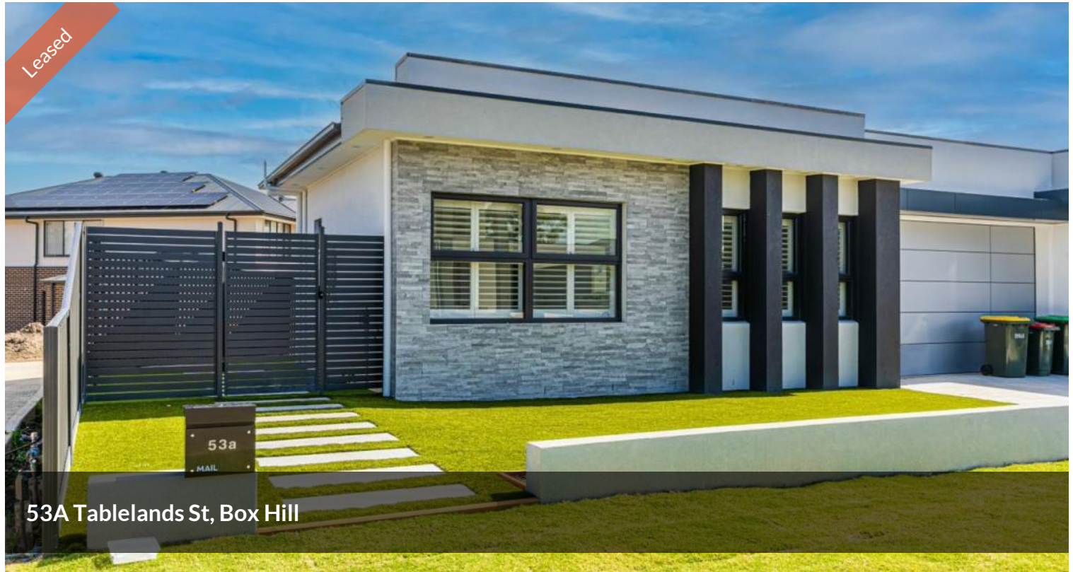
53A Tablelands St, Box Hill