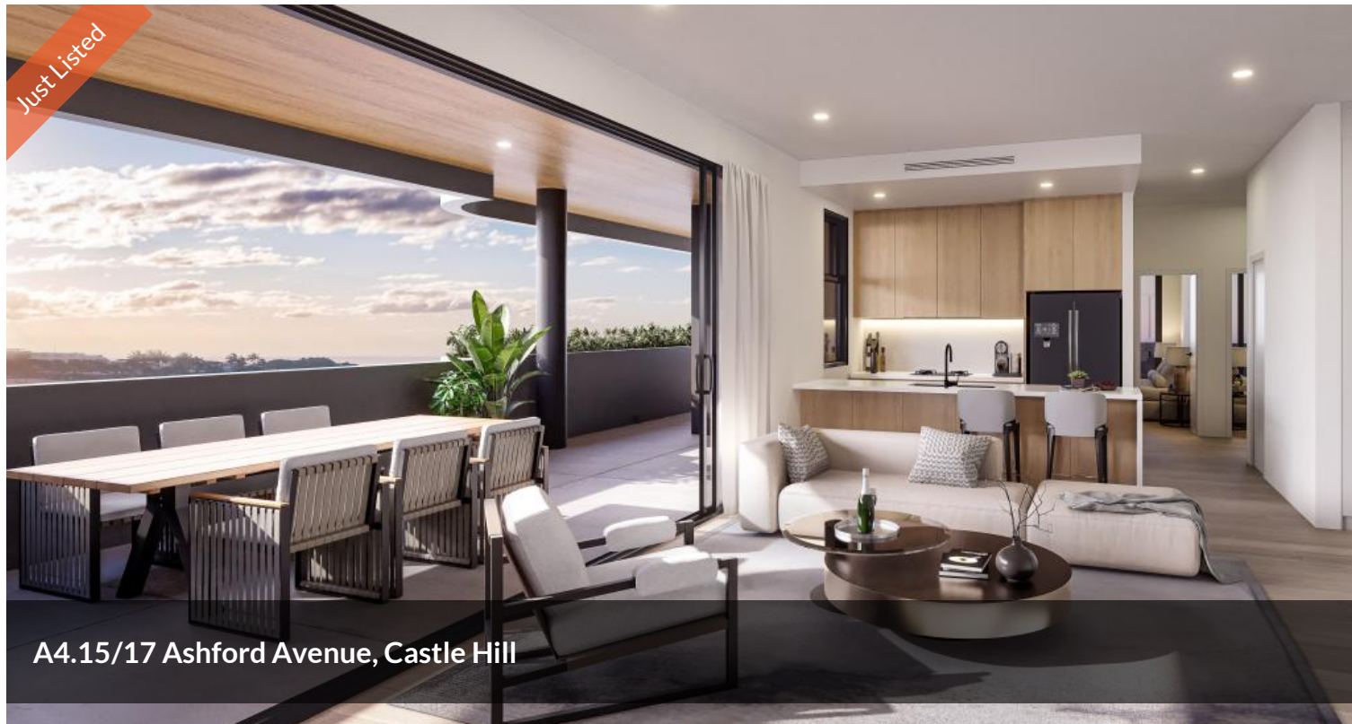
A4.15/17 Ashford Avenue, Castle Hill