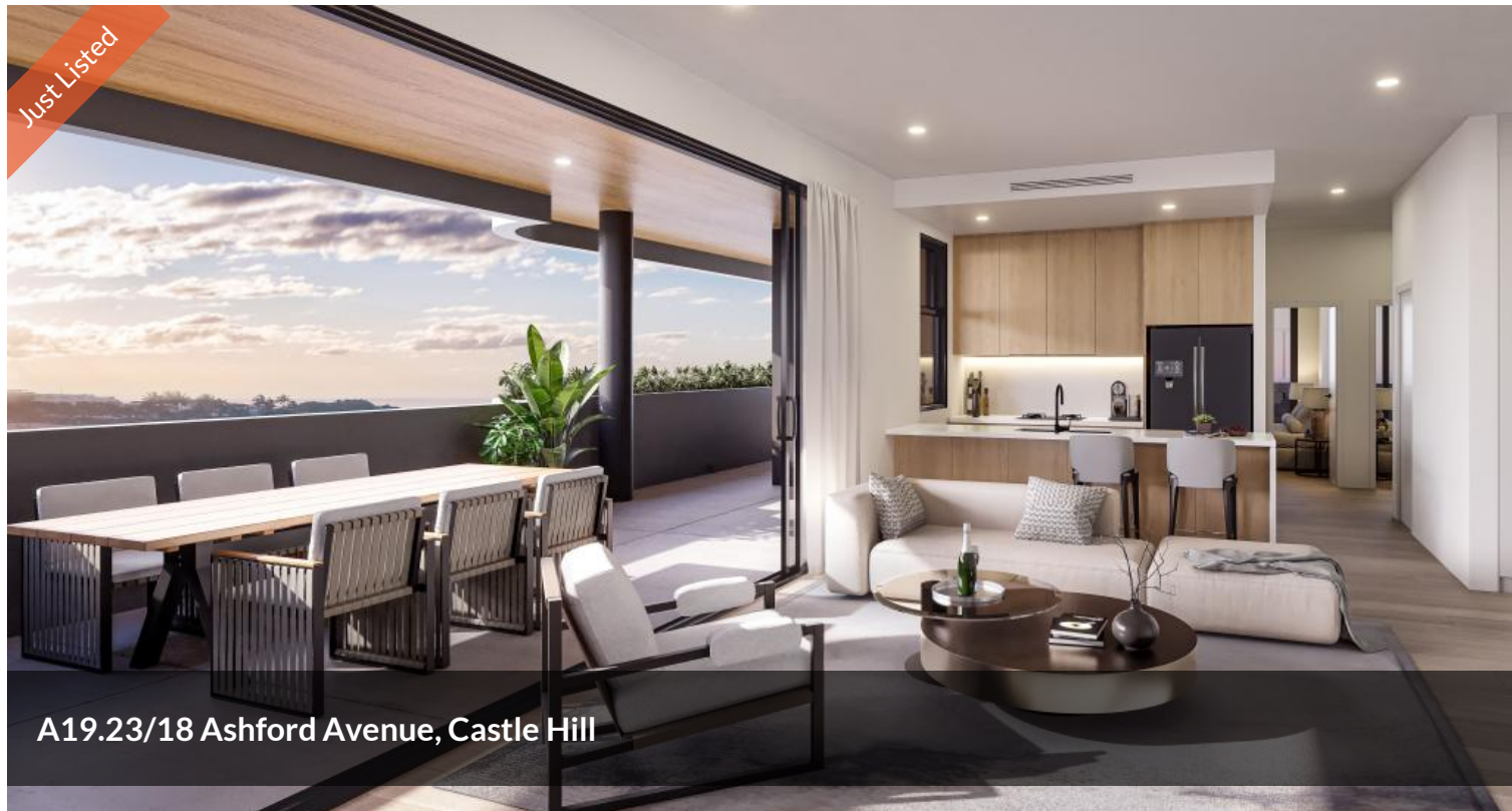
A19.23/18 Ashford Avenue, Castle Hill