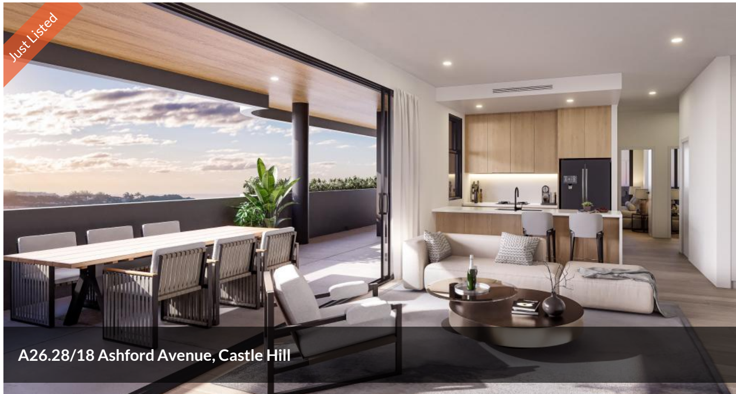
A26.28/18 Ashford Avenue, Castle Hill