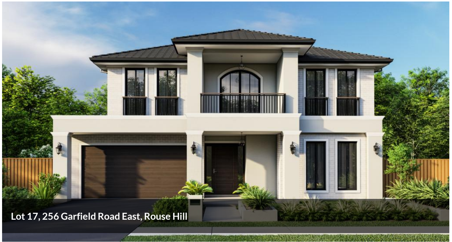
Lot 17, 256 Garfield Road East, Rouse Hill