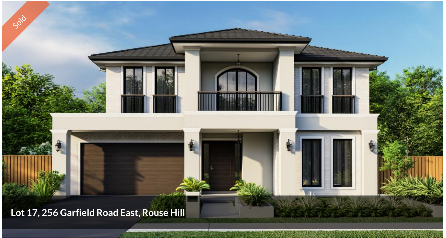
Lot 17, 256 Garfield Road East, Rouse Hill