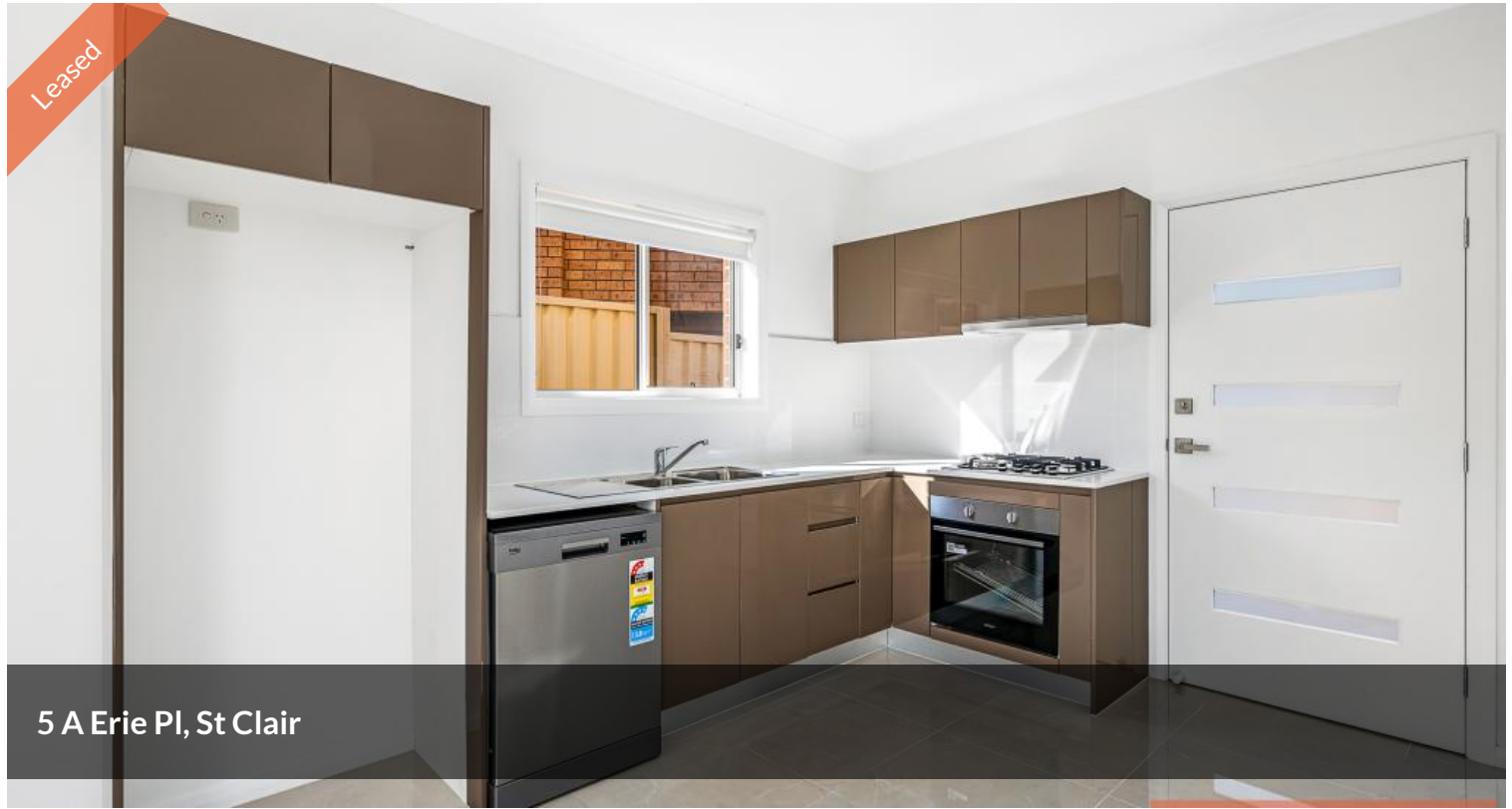
5 A Erie Pl, St Clair