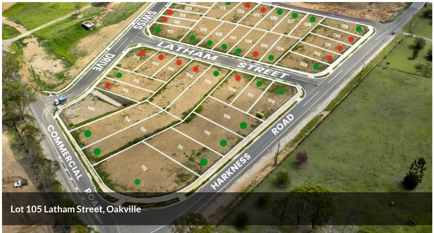
Lot 105 Latham Street, Oakville