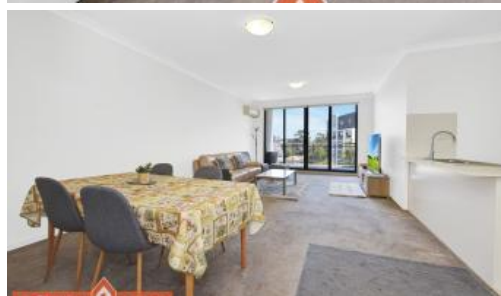
Unit 31, 26 Tyler St, Campbelltown