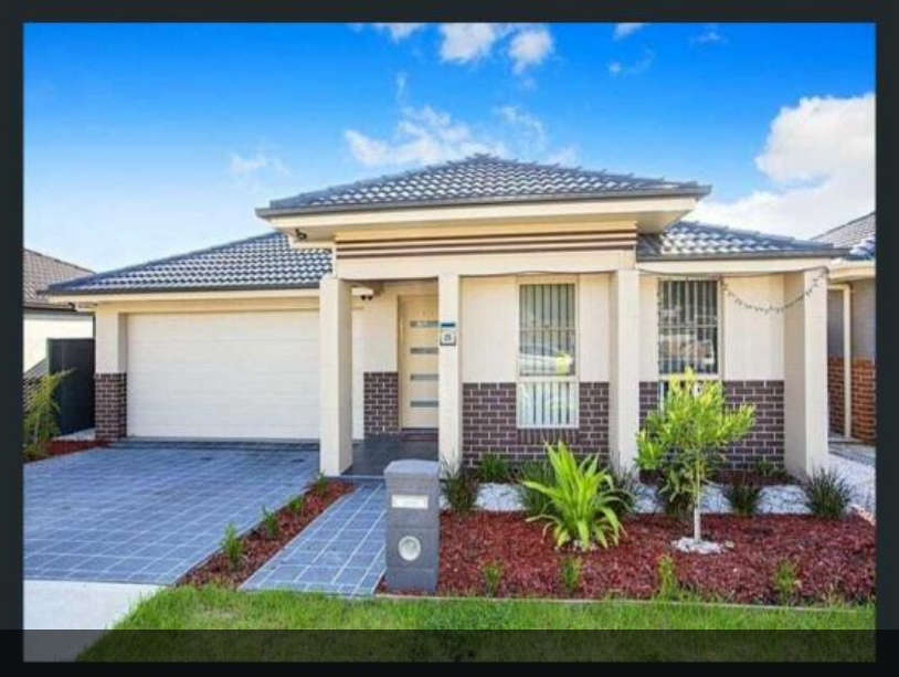
25 Allom St, Ropes Crossing