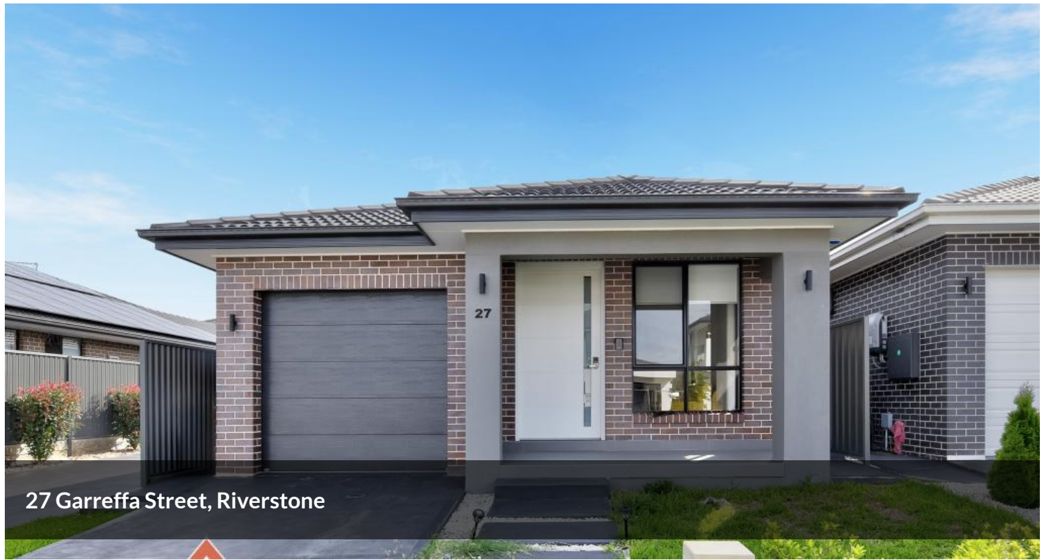
27 Garreffa Street, Riverstone