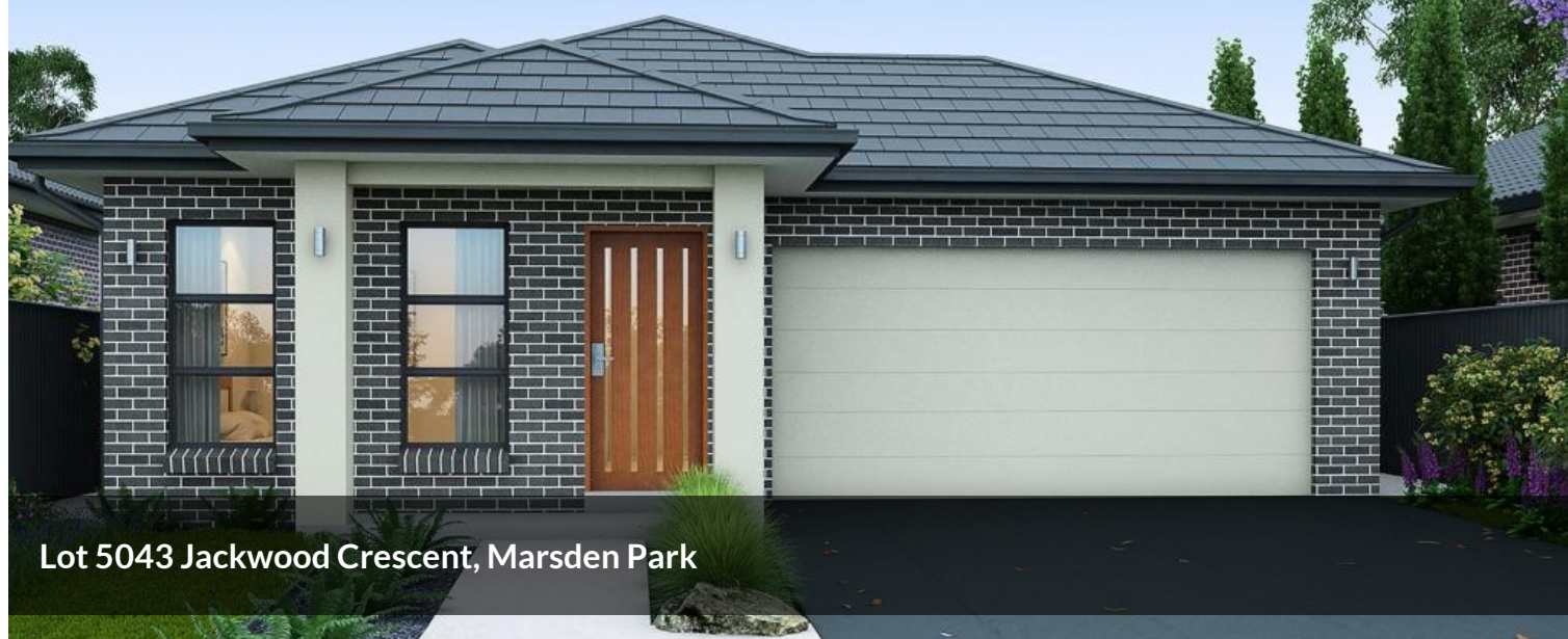
Lot 5043 Jackwood Crescent, Marsden Park