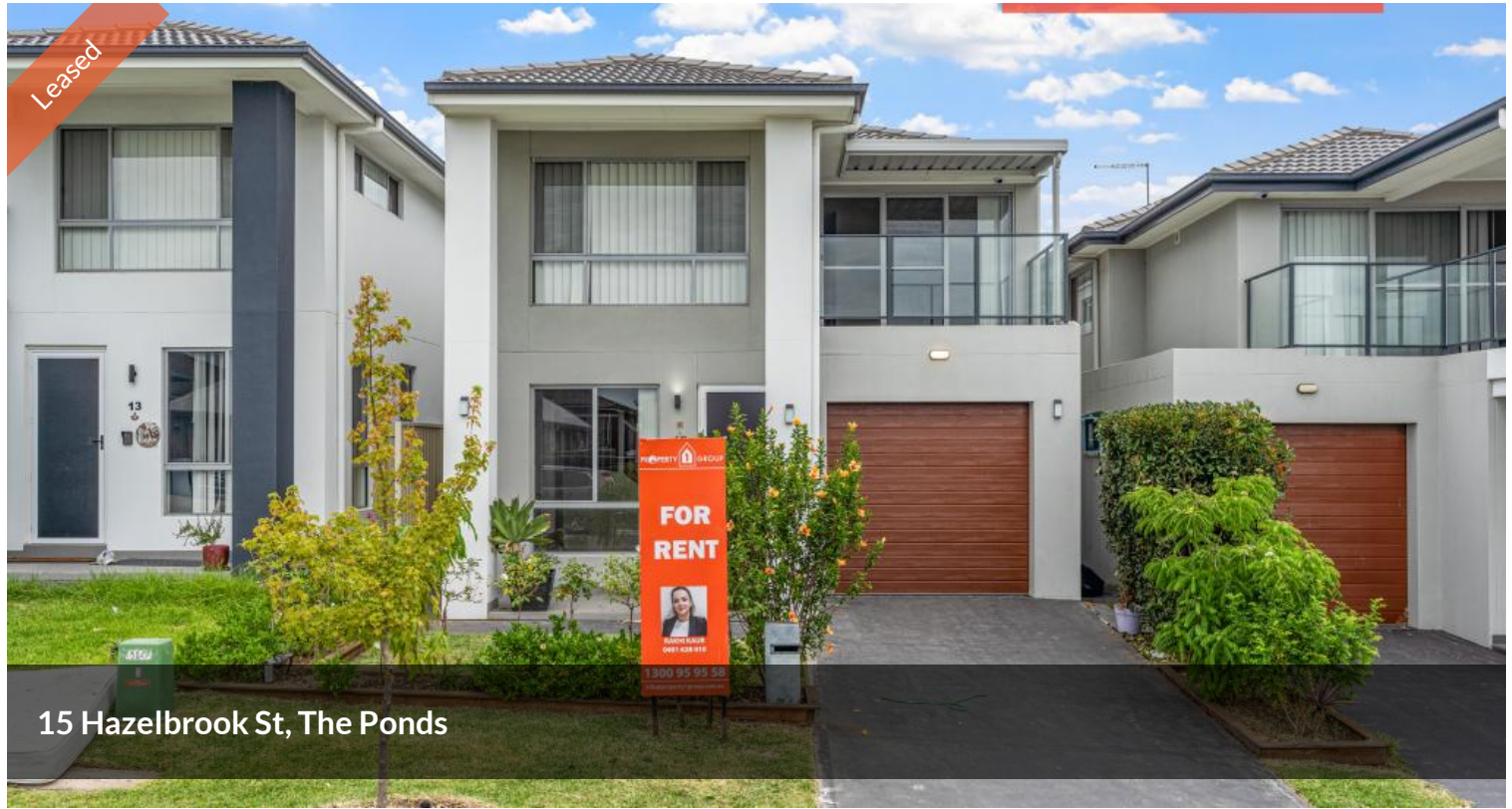
15 Hazelbrook St, The Ponds