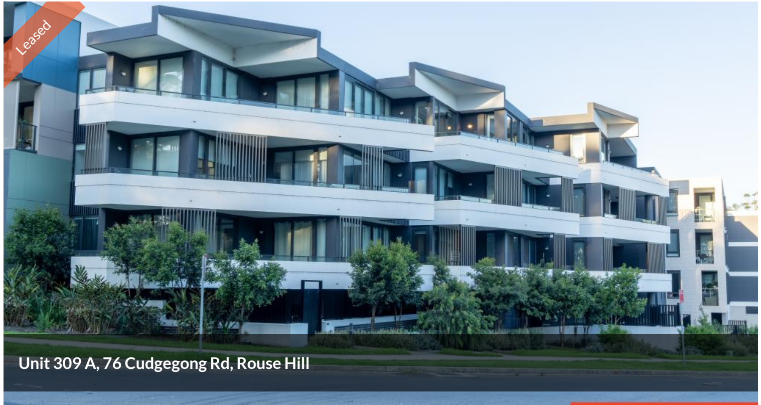
Unit 309 A, 76 Cudgegong Rd, Rouse Hill