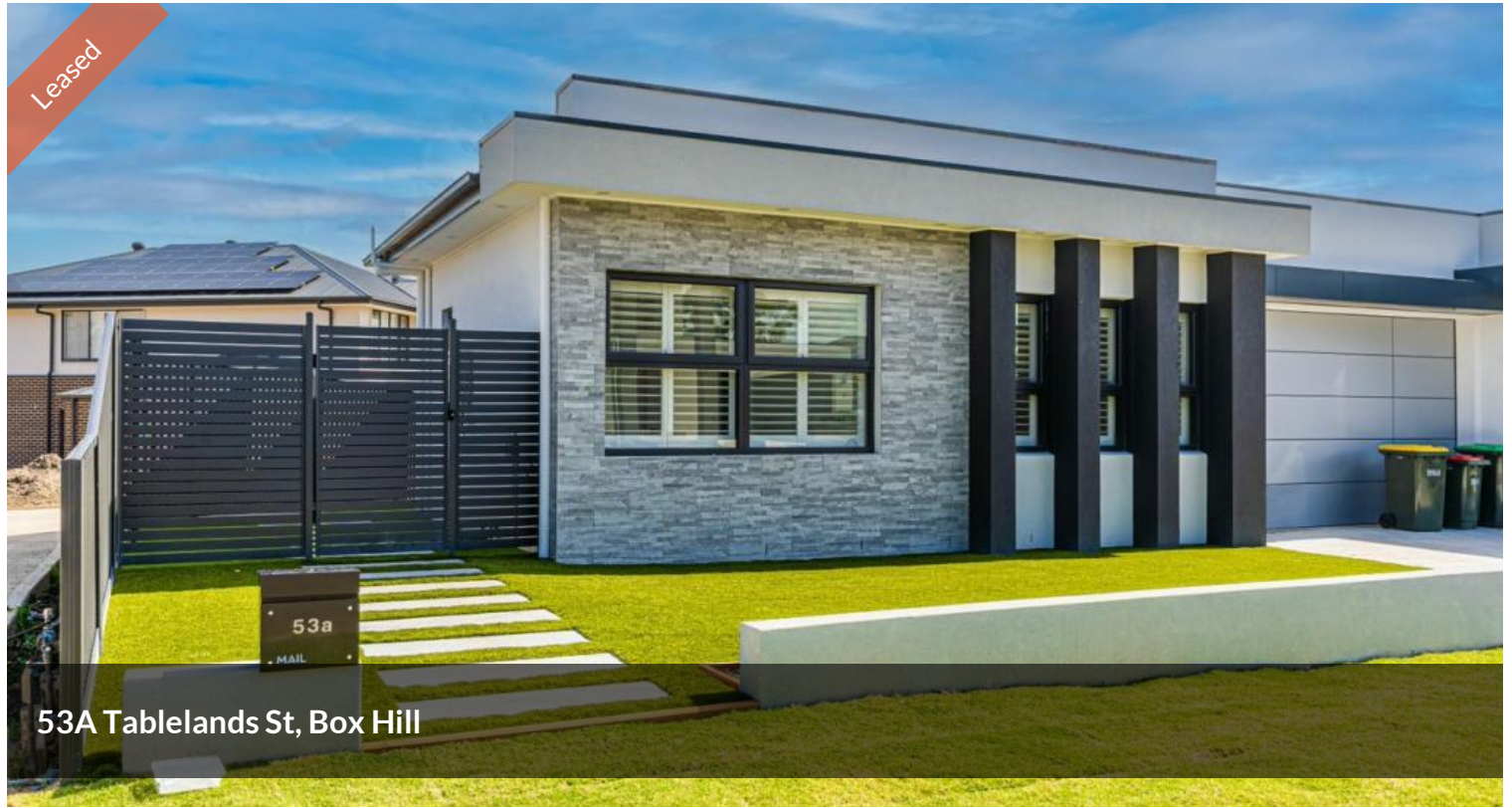
53A Tablelands St, Box Hill