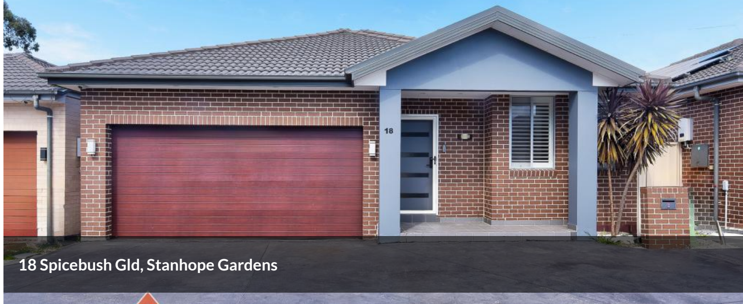
18 Spicebush Gld, Stanhope Gardens