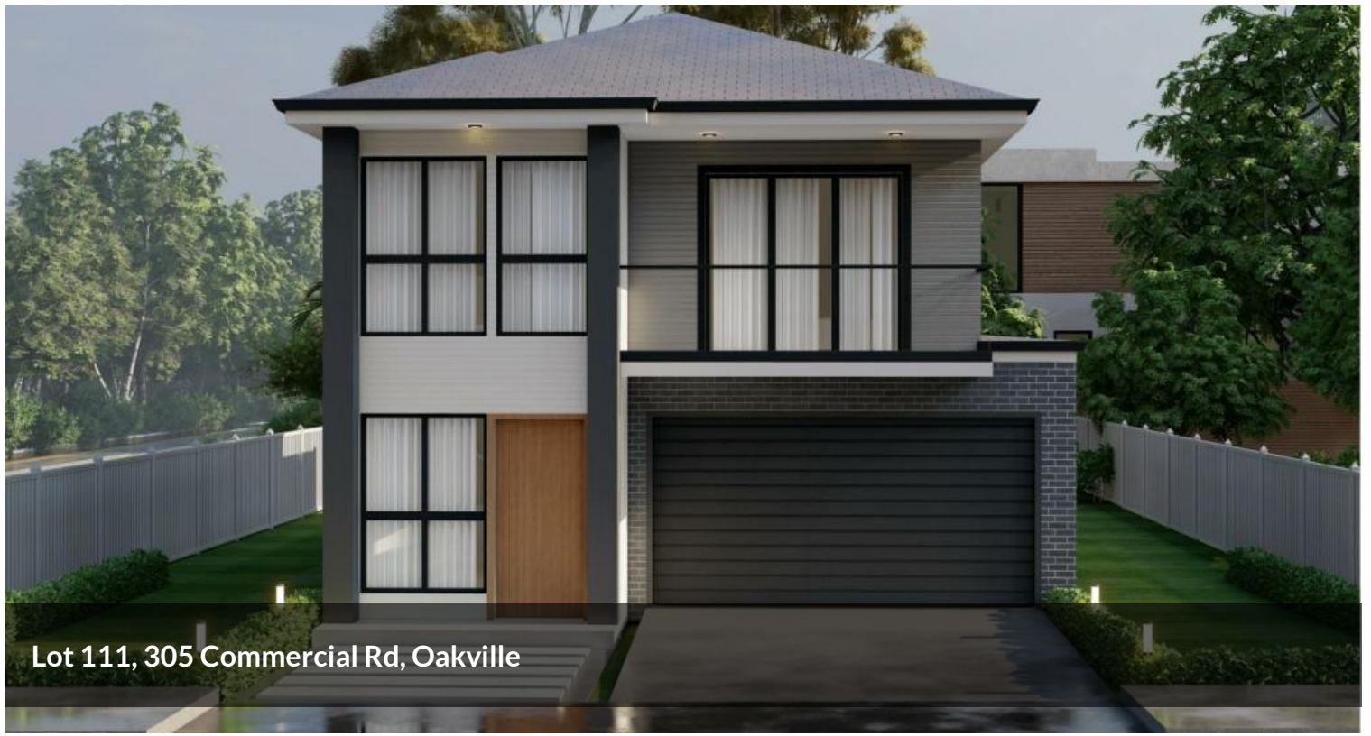
Lot 111, 305 Commercial Rd, Oakville