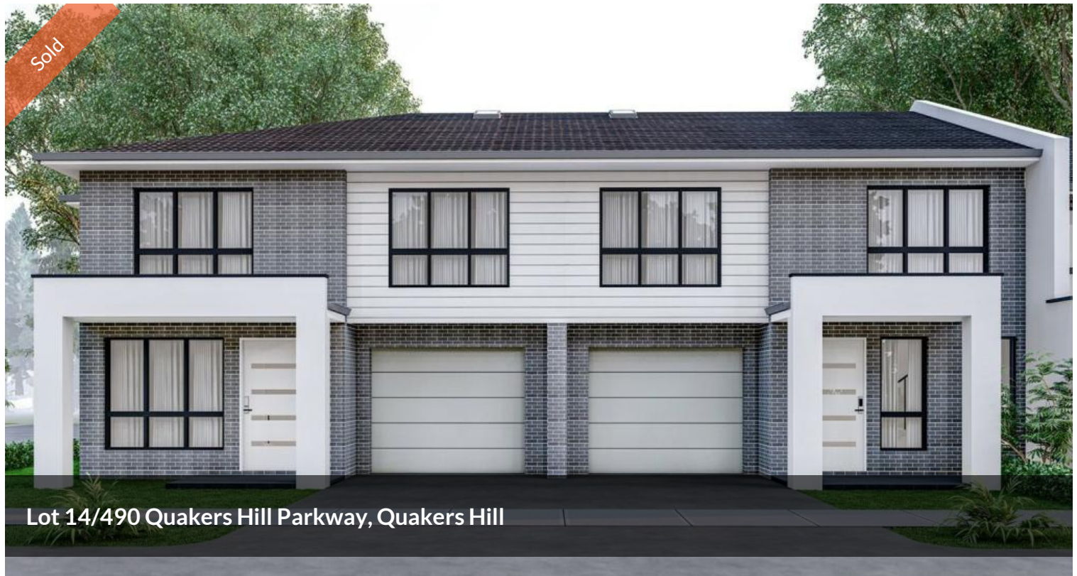
Lot 14/490 Quakers Hill Parkway, Quakers Hill