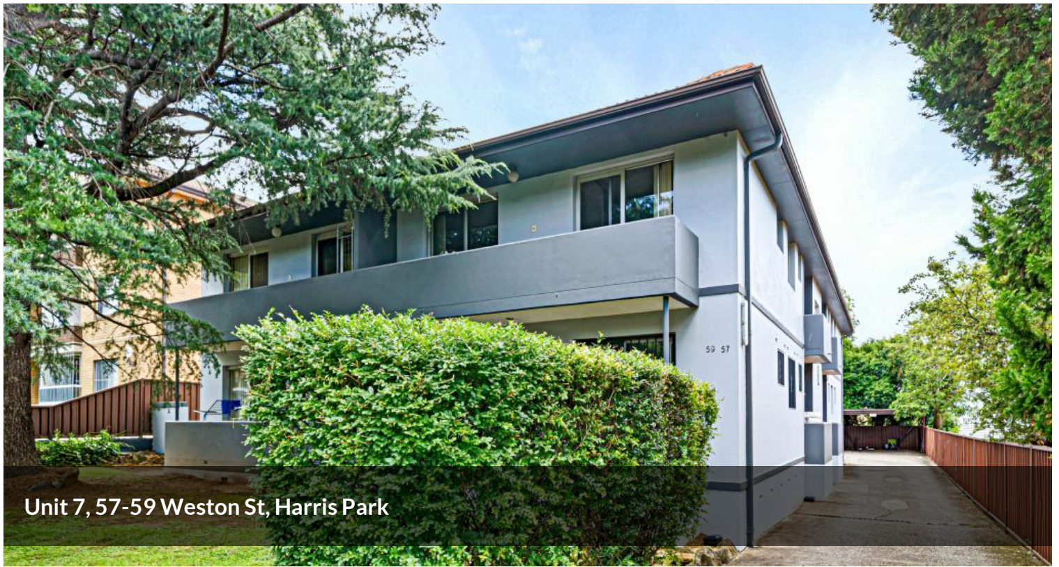
Unit 7, 57-59 Weston St, Harris Park